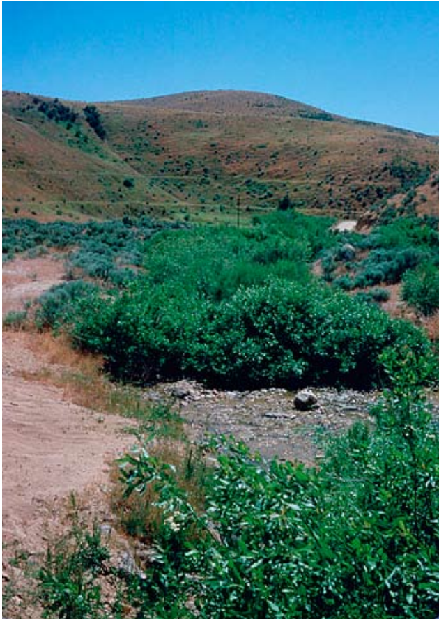
U.S. Fish & Wildlife Service

The most important factors limiting sharptail populations are the loss of open landscape caused by fire suppression, succession, and tree planting. Other pressures on population include predation, hunting, and disease, though these factors are minor compared to the overall loss of habitat.